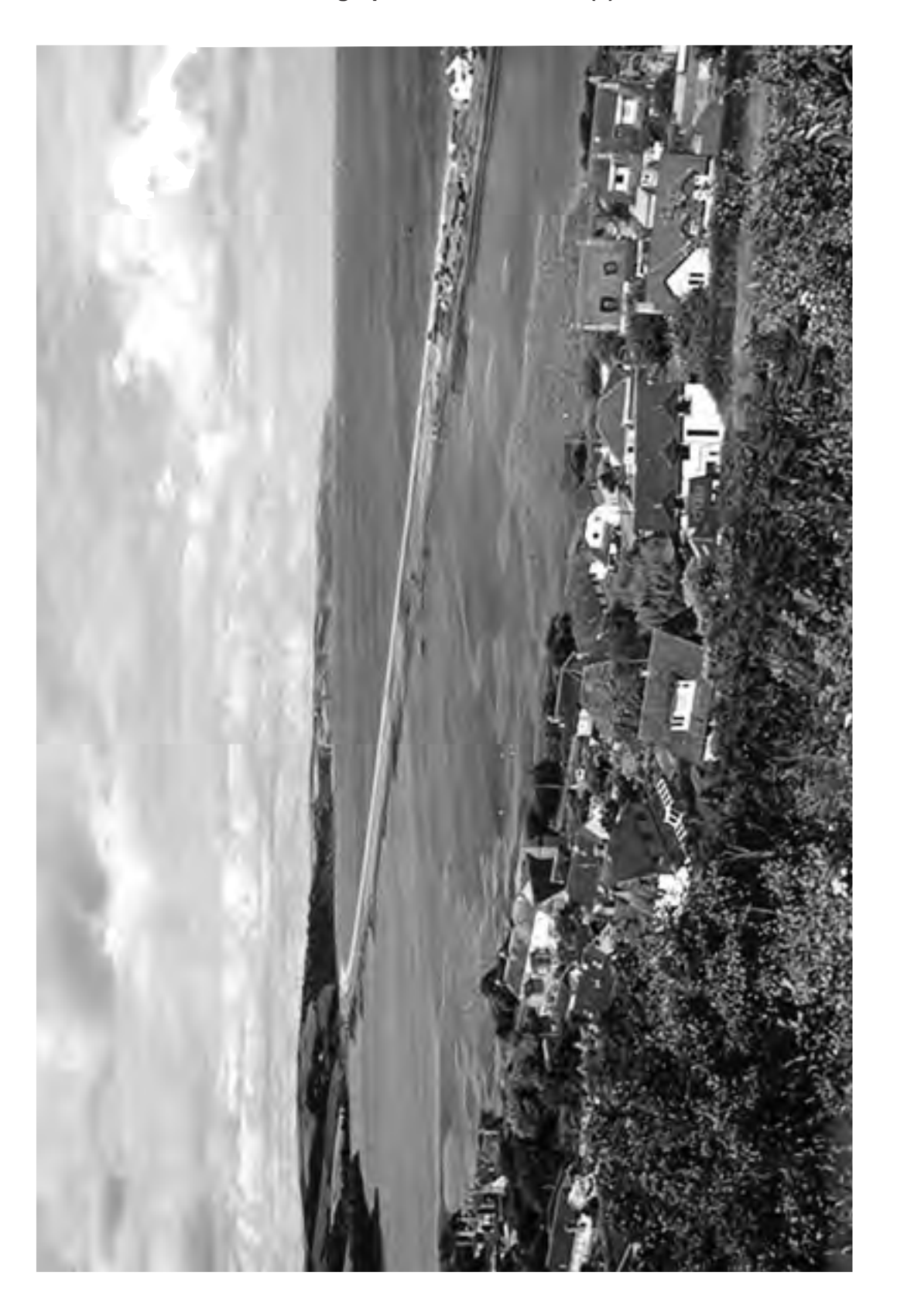
2 Photograph A for Question 3 (a)